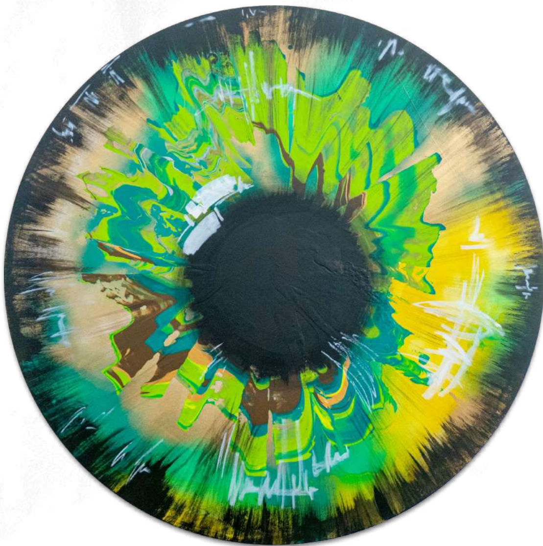
Living In Third Person #20 Acrylic On Canvas | Ø100 CM $ 1000

WWW.MAXRUEBENSAL.COM INFO@MAXRUEBENSAL.COM