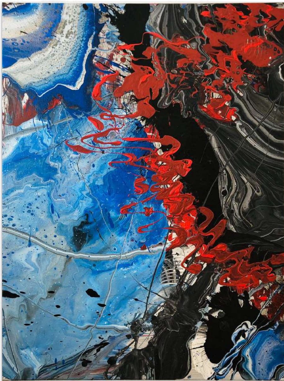
The Future Is Now Acrylic On Canvas | 60 x 80 CM SOLD

WWW.MAXRUEBENSAL.COM INFO@MAXRUEBENSAL.COM