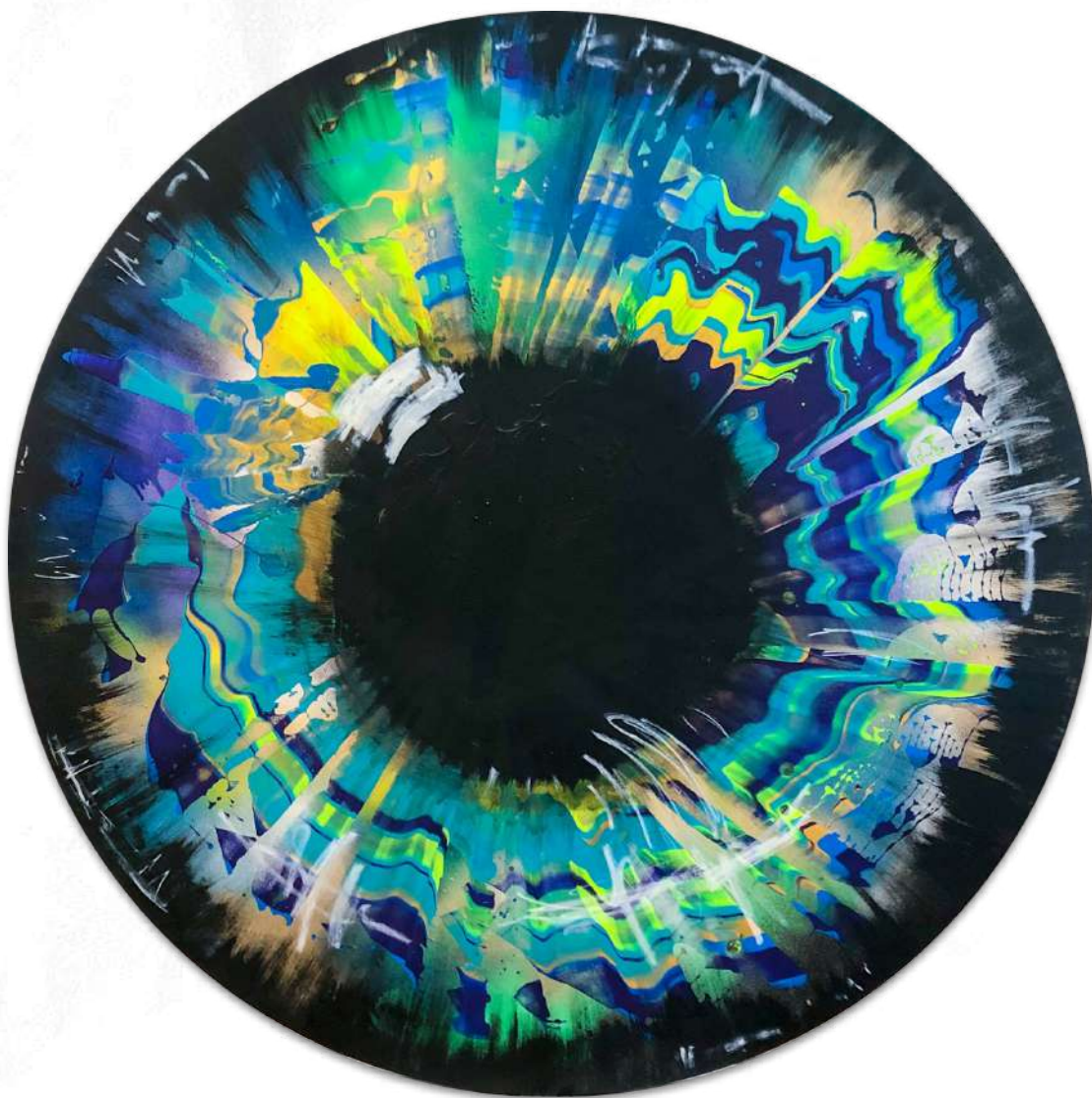
Living In Third Person #14 Acrylic On Canvas | Ø120 CM $ 1200

WWW.MAXRUEBENSAL.COM INFO@MAXRUEBENSAL.COM