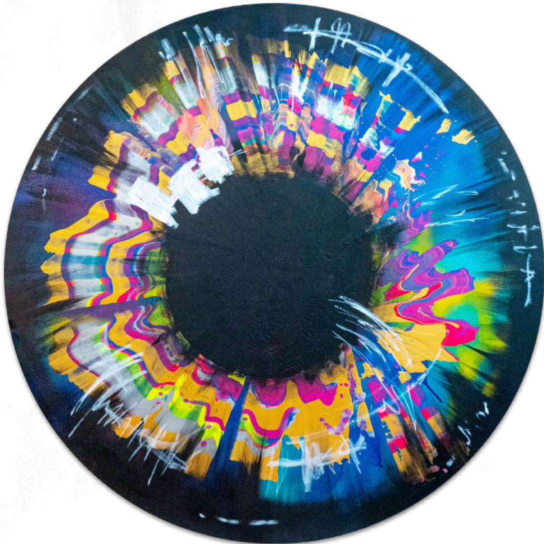
Living In Third Person #12 Acrylic On Canvas | Ø120 CM $ 1200

WWW.MAXRUEBENSAL.COM INFO@MAXRUEBENSAL.COM