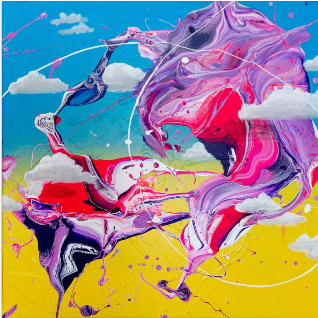
Head In The Clouds - Floccus #1 Acrylic On Canvas | 50 x 50 CM SOLD

WWW.MAXRUEBENSAL.COM INFO@MAXRUEBENSAL.COM