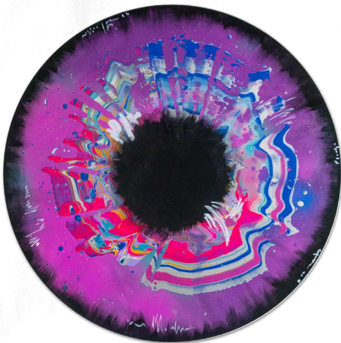
Living In Third Person #20 Acrylic On Canvas | Ø100 CM $ 1000

WWW.MAXRUEBENSAL.COM INFO@MAXRUEBENSAL.COM